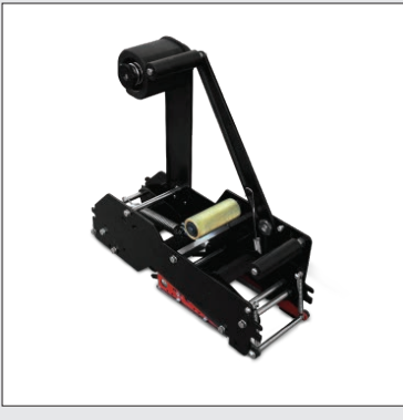
Spare Tape Head