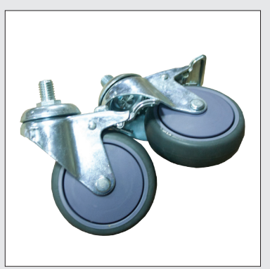
Locking Casters w/Support Brackets