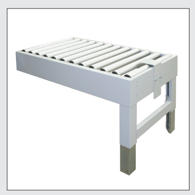
Long Exit Conveyor