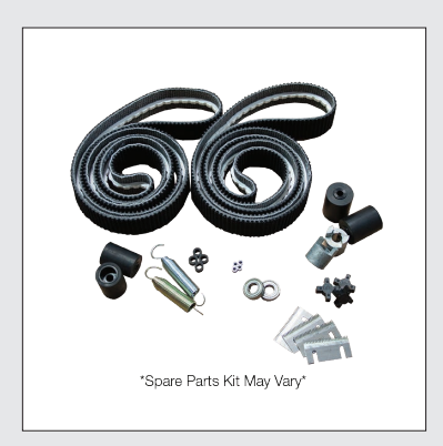
Spare Parts Kit