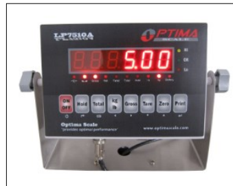
Built in Scale with Display